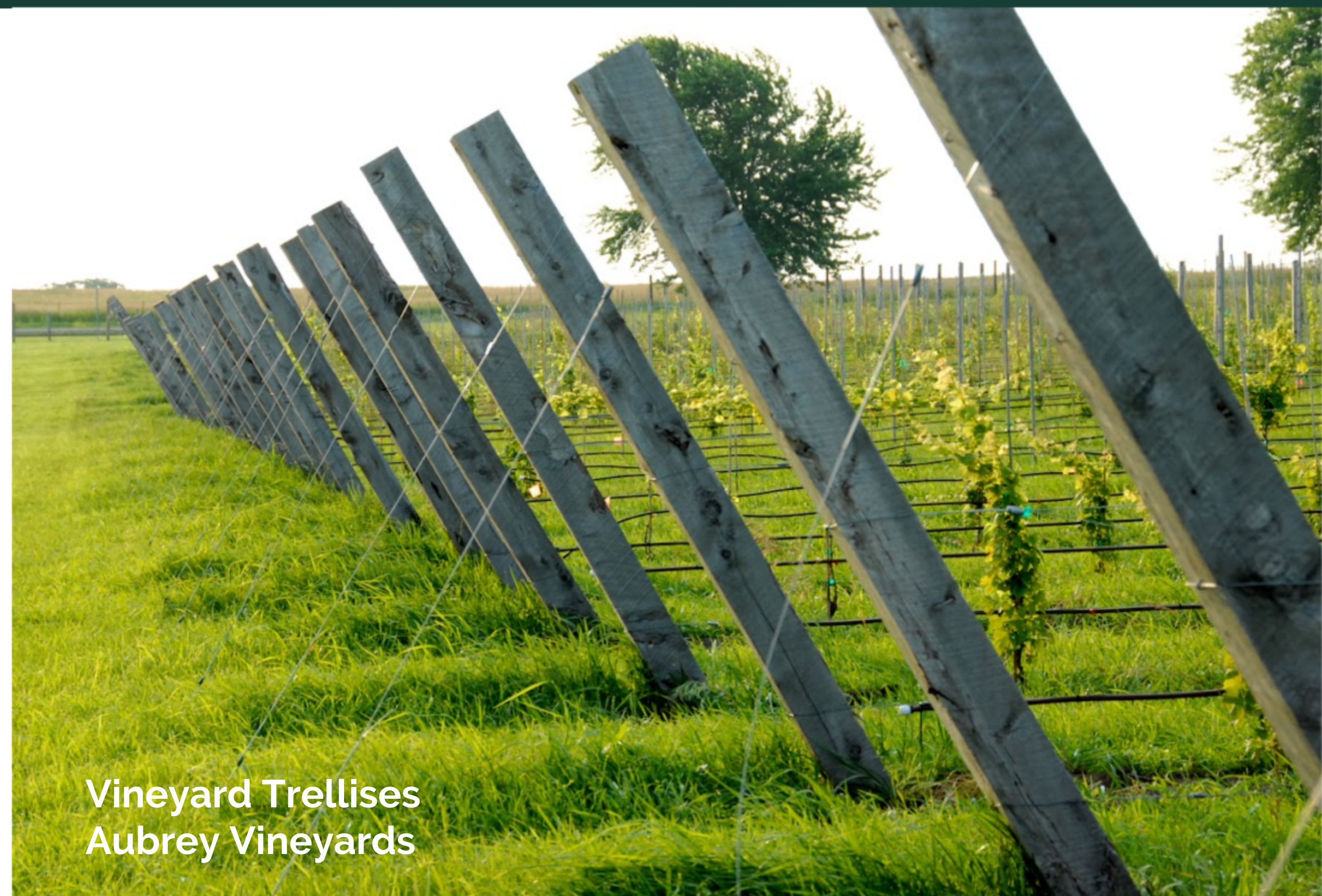
Vineyard Trellises Aubrey Vineyards