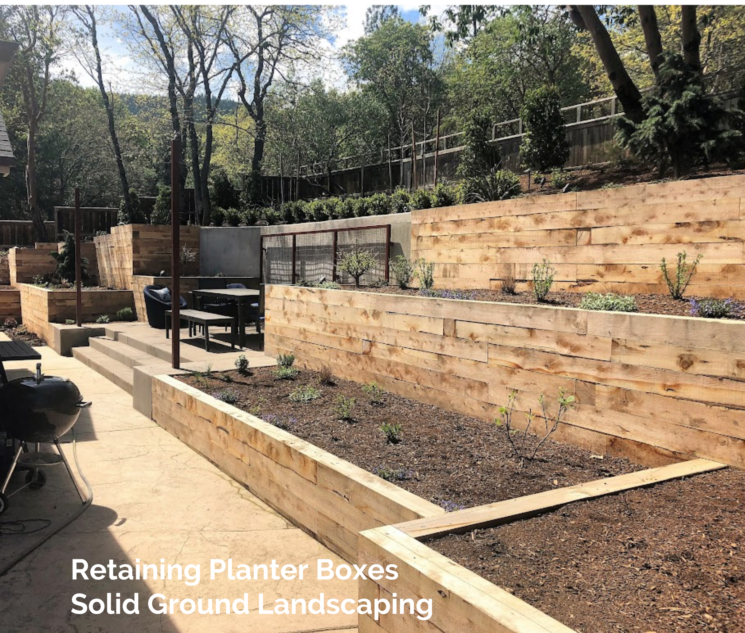
Retaining Planter Boxes Solid Ground Landscaping