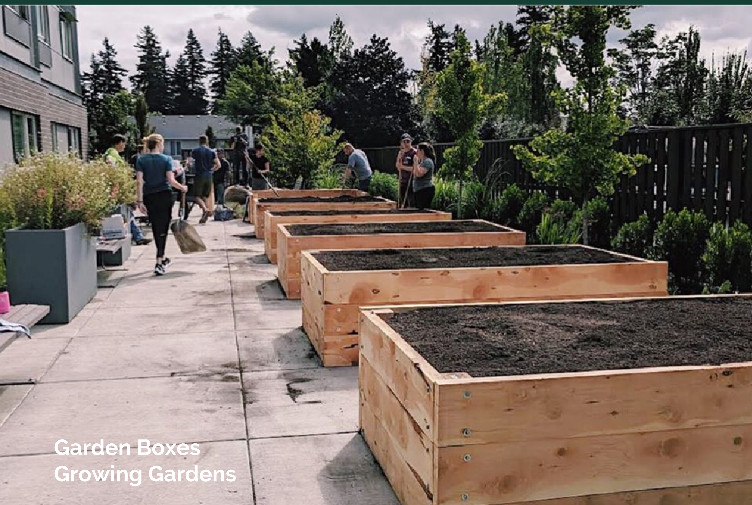
Garden Boxes Growing Gardens