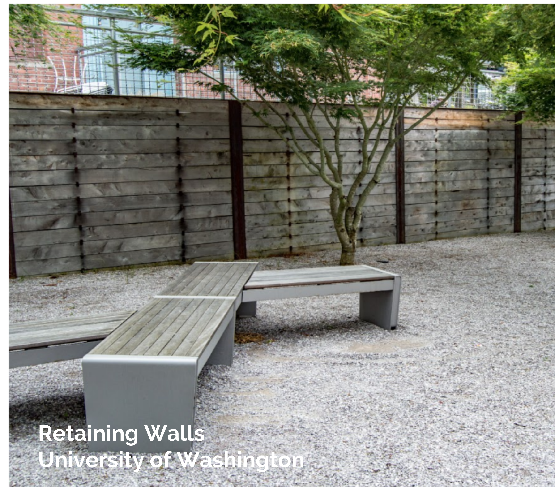
Retaining Walls University of Washington