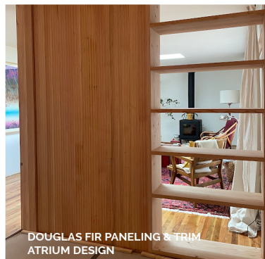
DOUGLAS FIR PANELING & TRIM ATRIUM DESIGN