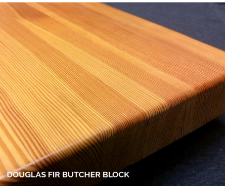
DOUGLAS FIR BUTCHER BLOCK