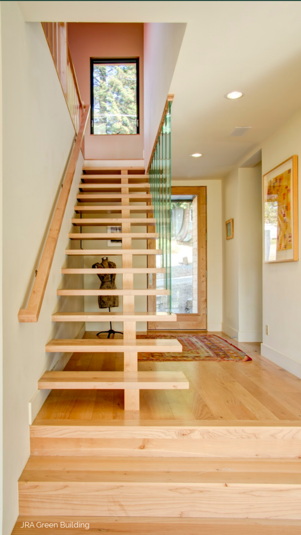
JRA Green Building

SUSTAINABLE NORTHWEST WOOD is the bridge between responsible forestry, beautiful local wood products and your building project. Our mission is to foster a wood products community where each purchase for the built environment ensures resilience in the natural one.