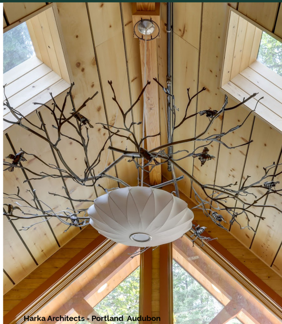
Harka Architects - Portland Audubon