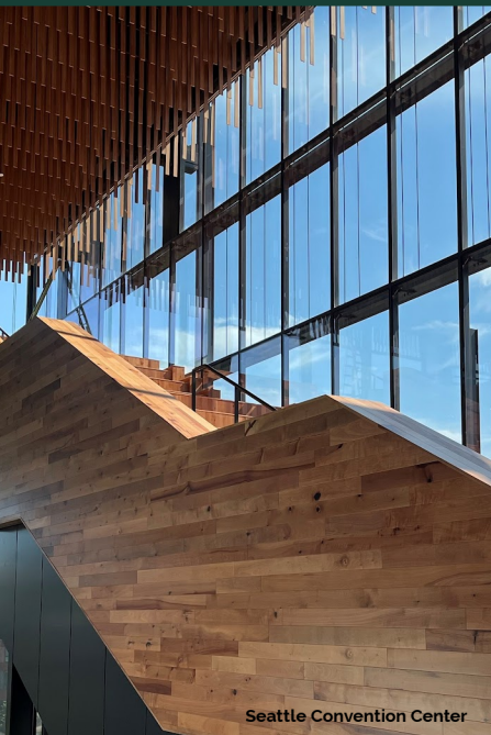
Seattle Convention Center