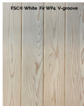
FSC® White Fir WP4 V-groove